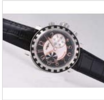
Vintage De Witt Academia Chronograph Automatic with Black Dial AAA Watches [S7R3]