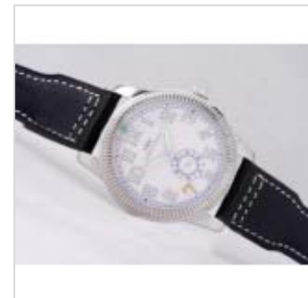
Cool De Witt Academia Working Chronograph with White Dial-Same Structure