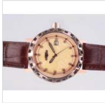
Perfect De Witt Academia Automatic Rose Gold Case with Yellow MOP Dial-H AAA Watches [M7X6]