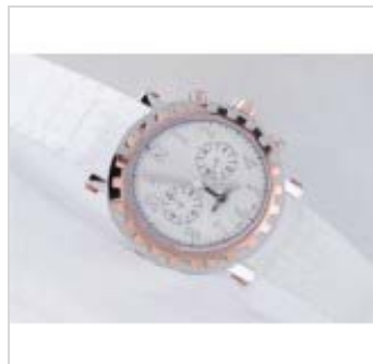
Modern De Witt Academia Working Chronograph with Rose Gold Case-Same